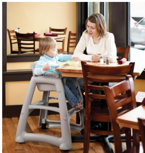
*2006 Rubbermaid Study