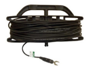
25m Extension Lead 6005-0075