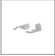
KRAV-05IN grey End cap Ref: 24308