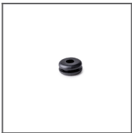
8,8x2,0 Gland Ref: 00802L