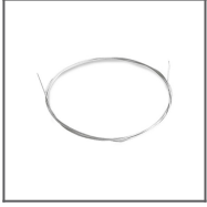
Steel wire FI-1 1m Ref: 1397