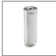
PUSZ-LIN-ZD Fastener Ref: 42257