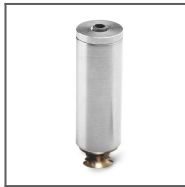
PUSZ-LIN-MR Fastener Ref: 42258