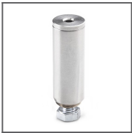
PUSZ-LIN-LEB Fastener Ref: 42259