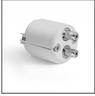
JAZ-DUO-W grey electricity conductive End cap Ref: 42633