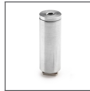
PUSZ-LIN-ZM Fastener Ref: 42256