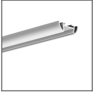
TOST Profile Ref: B5393